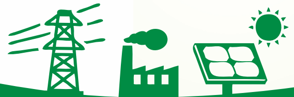
ABB Microgrid to be installed at IIT Roorkee as part of Joint Smart Campus Development

ABB, an ISGF Member, inaugurated ABB Microgrid at Indian Institute of Technology, Roorkee (IITR) as part of the extended R&D collaboration between ABB and IITR to create platforms for research on various aspects of Smart City Technology deployment. The groundbreaking ceremony of ABB Microgrid with Battery Energy Storage was held on 25th January 2019 to commence the Smart Campus Development Project at IITR. This project is part of the larger R&D collaboration outlined in an MoU between ABB and IITR signed in July, 2018. The agreement for technology collaboration also includes the creation of a Smart Grid Resource Center, joint R&D facilities and support for PhD students.